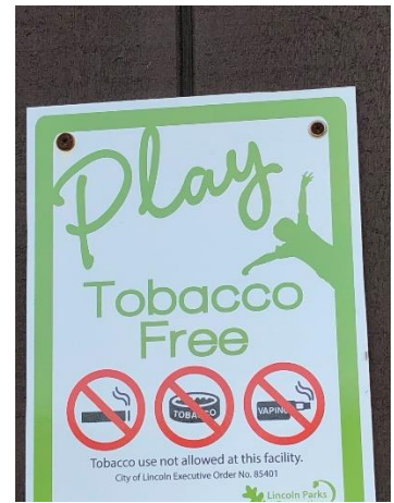
Photo 8 & 9: Play Tobacco Free Signs on Pavillion at Oak Lake Park