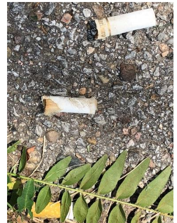
Photo 12: Cigarette Butt Litter on Playground Near Park Bench at Oak Lake Park