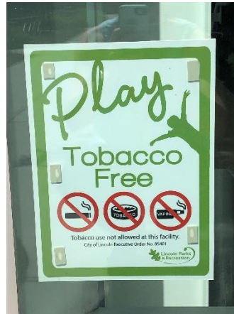
Photo 34,35,36: Woods Park Play Free Tobacco Signage: Tennis Center and Swimming area