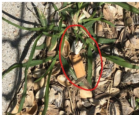
Photo 5: Mahoney Park Playground Picnic shelter cigarette butt litter