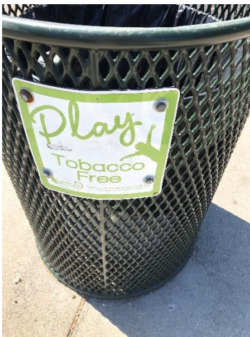
Photo 38: Woods Park Play Free Tobacco Signage on Trash Receptacle