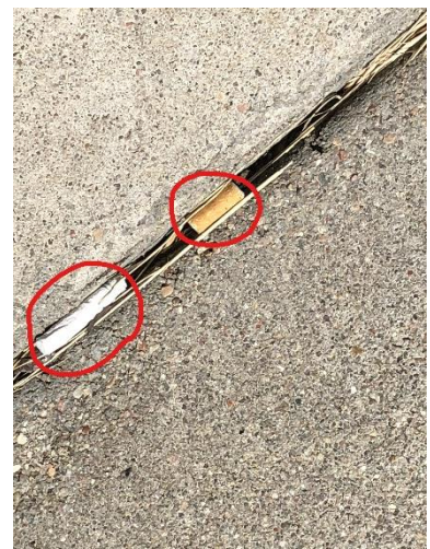
Photo 39 & 40: Woods Park Cigarette Butt litter near the Tennis Center area and parking lot