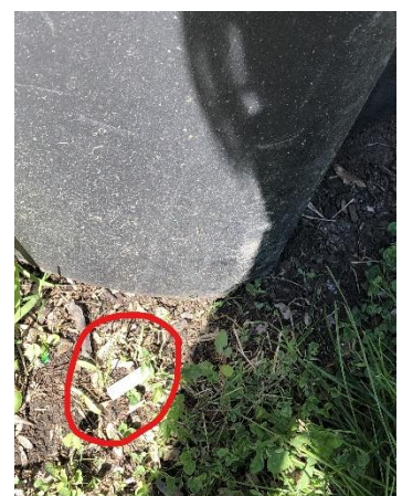
Photo 6: Mahoney Park cigarette butt near trash receptacle; no Play Tobacco Free signage