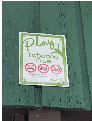
Photo 10 & 11: Play Tobacco Free Signs on Trash Receptacle and Equipment Shed at Oak Lake Park