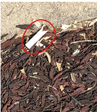
Photo 13: Cigarette Butt Litter at the Edge of the Playground at Oak Lake Park